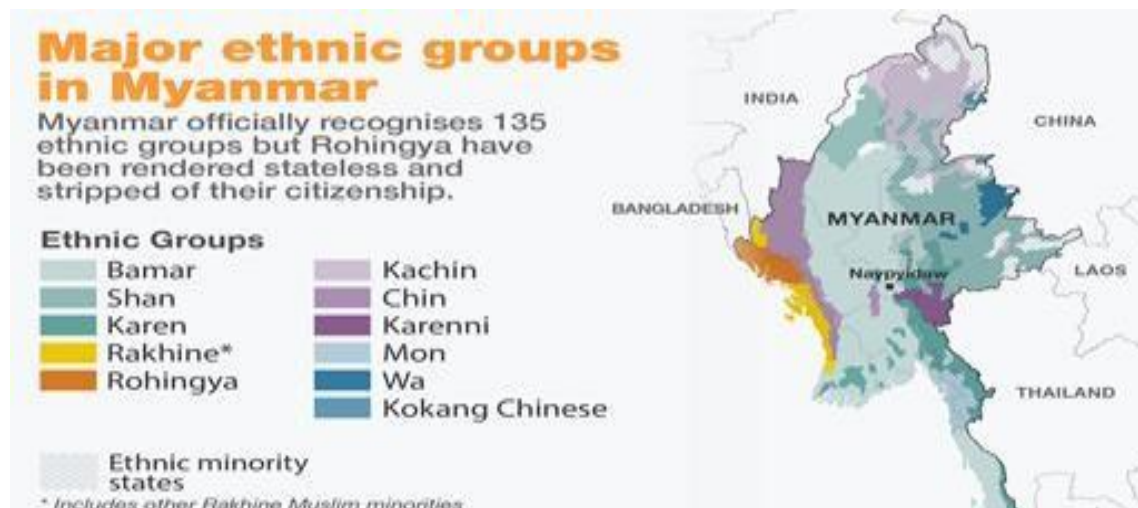
Figure 1: "Burma Insurgency and the Politics of ethnicity", by Martin Smith.

They are the most vulnerable victims of the refugee crisis [6]. Rohingya refugee crisis is the world's rapidly emerging humanitarian crisis. In this 21st century, one of the most inhumane exoduses is the 'Muslim Rohingya exodus from Myanmar and they're perceived as the most mistreated minority ethnic group.